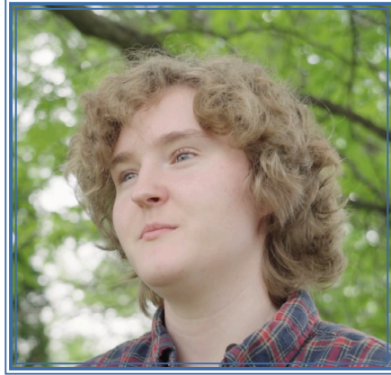
-Eden Energy Works Program

“I wanted to be able to help in a hands-on and tangible way with the response to the climate crisis and I knew this was one way to do that.”